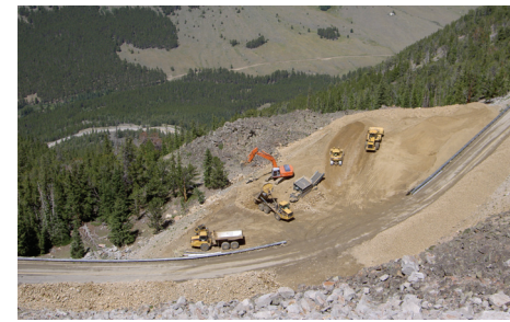
Beartooth Highway, MT.

The Beartooth Highway begins at the northeast entrance to Yellowstone National Park and links the communities of Cooke City and Red Lodge,