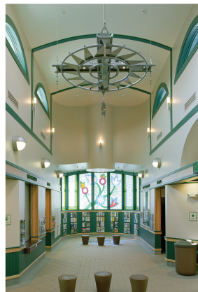
From top: Pojoaque Corridor, NM. Cotter Bridge, AR. Allegany River Rest Area, NY. MnPASS system, MN. J. Douglas Galyon Depot, Greensboro, NC.