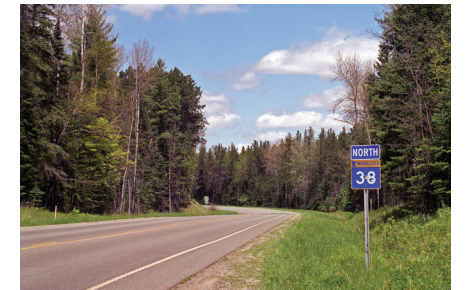
Minnesota Trunk Highway 38.