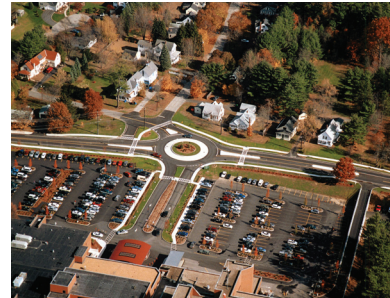
Top: Grand Loop Road, Yellowstone National Park. Bottom: MassHighway's new Project Development and Design Guide features Nationwide best practices.