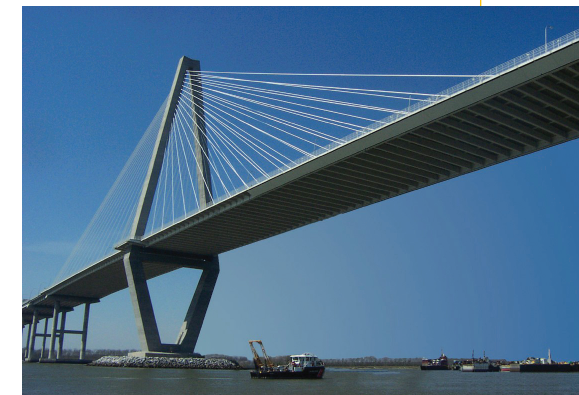
Top: Cooper River Bridge, Charleston, SC. Bottom: North Torrey Pines Road Bridge, San Diego, CA.